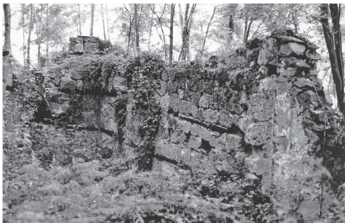
Peći – Remains of the Stara džamija, 2001