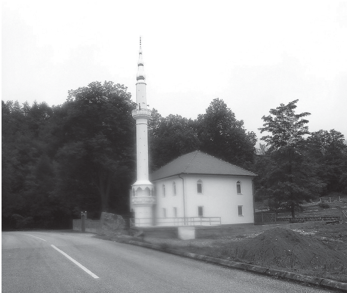
Dobrak – Rebuilt mosque at Dobrak, 2007

for one massive chunk of concrete. The following two photos show the empty site of the mosque, and a view of the mosque after it was rebuilt in 2007 – with the same massive chunk of concrete still in place, next to the road.