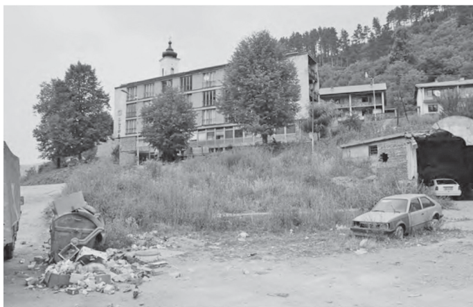
Srebrenica – Site of the destroyed Čaršijska džamija, 2002

The remains of the four mosques that had stood in the center of Srebrenica until they were destroyed were taken away and buried in a "mass grave for mosques," which was unearthed by accident during excavation for the construction of a new municipal parking garage in January 2020. 6