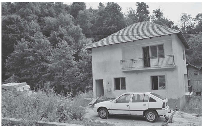
Srebrenica – Site of the destroyed Dozića džamija, 2002

A photograph that I took in July 1992, seven years after the war, shows the imam's house, which had been burned out in 1995, with a new roof and undergoing repairs. Next to the house, the empty site where the historic Đozić mosque once stood is overgrown with weeds.