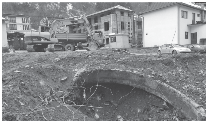
Srebrenica – “Mass grave for mosques” uncovered in 2020

One of Srebrenica’s oldest mosques stood in the Crvena Rijeka neighborhood. This mosque had been endowed in the Ottoman period by the Đozić family and was known as the Đozića džamija. 7 It was a traditional Bosnian mosque, with a wooden portico and a wooden minaret sprouting from the roof beams. Below is a prewar photo of the mosque, from the archive of the Institute for the Protection of Cultural Heritage of Bosnia and Herzegovina. The imam’s house, located next to the mosque, also housed the historical records of the Medžlis of the Islamic Community of Srebrenica and a schoolroom for teaching Qur’an reading.