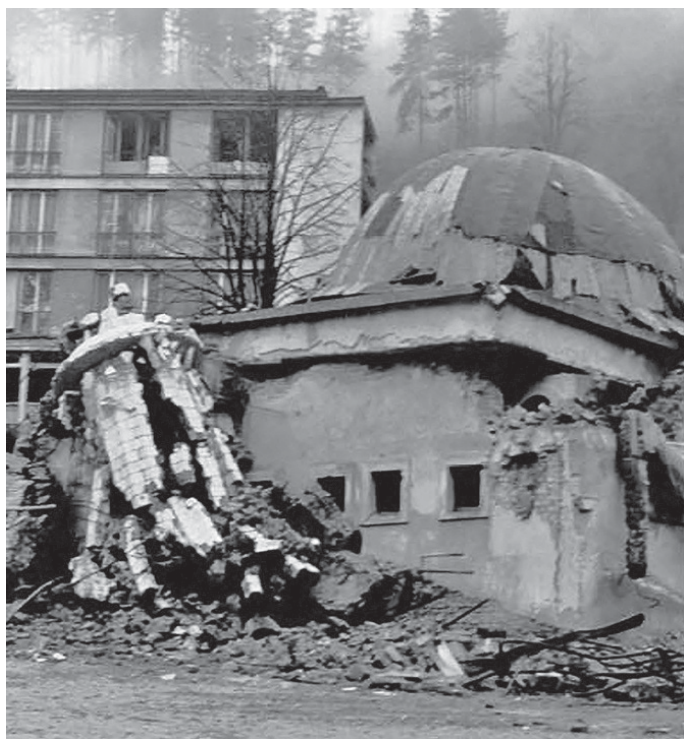
Srebrenica – Čaršijska džamija, 1996, (Photo: Amnesty International)

This is a view of what was left of the Market Mosque at the end of the war, in early 1996. The building is completely destroyed. The concrete roof slab supporting the dome over the main prayer hall has dropped from a height of two storeys, coming to rest at a tilt on top of the remains of the mosque's foundation walls (note the little square windows). The stump of the blown-up minaret, splayed apart by the explosive charges placed in its internal staircase, can be seen at left.