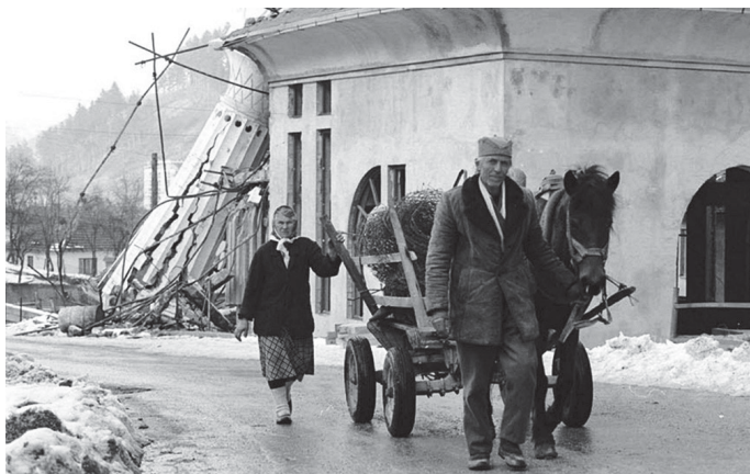
Srebrenica – Petrička džamija, 1996