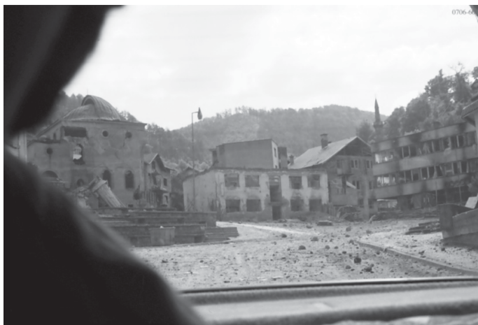
Srebrenica – Čaršijska džamija, 19/07/1995, (Photo: Đorđo Vukoje / ICTY)

Five days later, on 19 July 1995, the Market Mosque was blown up by Bosnian Serb Army sappers. Đorđo Vukoje, a reporter for the Belgrade bi-weekly Srpska Reč , arrived on the scene just after the minaret had been toppled with explosives, scattering rubble across the square. He secretly took this photo from the front seat of his car. As he notes in the caption of the published version of the photo, this was the last picture taken of the Market Mosque. Half an hour later, he writes, the mosque was "turned into dust and ashes."