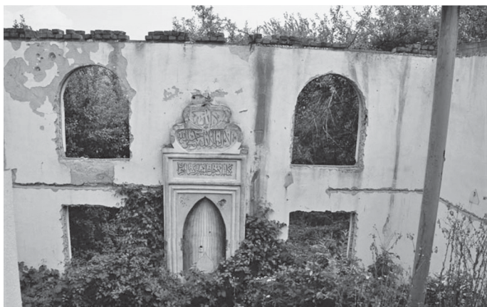
Liješće – Interior of the destroyed Liješće mosque, 2002