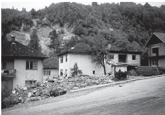
Srebrenica – Petrička džamija, 1998

In the center of Srebrenica stood the town's largest mosque, the Čaršijska džamija, the Market Mosque. Built shortly before the war to replace an older mosque that had fallen into disrepair, the new Market Mosque had also made it through the 1992-95 siege unharmed. In May 1995, the mosque was scene of the Srebrenica community's last, festive Baĵram prayers.