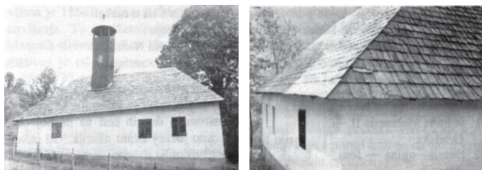
Peći – Stara džamija, 1990

Among the few documents that record the Old Mosque in Peći as it once was, are these two photos, published in 1990, just before the war.