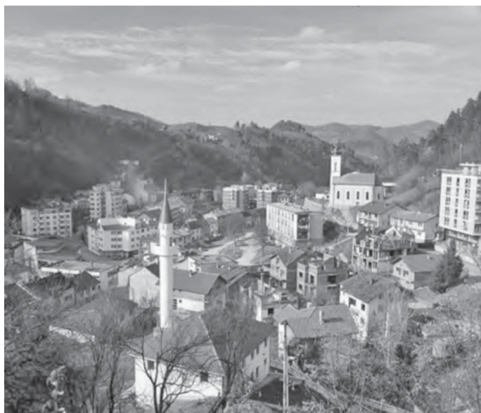
Srebrenica – White Mosque following postwar reconstruction, 2002

On a hill overlooking the Srebrenica suburb of Soloćuša and the road heading north towards Bratunac stood the Vidikovac mosque, endowed in 1989 by Azem Begić. 11 In the last months of the 1992-1995 siege, the mosque's roof had suffered damage from Bosnian Serb Army shelling, but the Vidikovac mosque was still being used for communal prayers during Srebrenica's last wartime Bajram holiday, in May 1995.