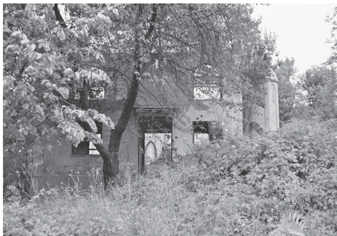
Liješće – Exterior of the destroyed Liješće mosque, 2002

The destruction of Srebrenica's mosques and of its Bosniak Muslim communities did not start in 1995. It began in the first days of the war. An example is the village of Liješće, in the eastern part of the municipality of Srebrenica, near Skelani on the Drina River. When Liješće was overrun by Bosnian Serb forces on 8 May 1992, its residents were forced to flee, its mosque was burned down, and the mosque's minaret was blown up.