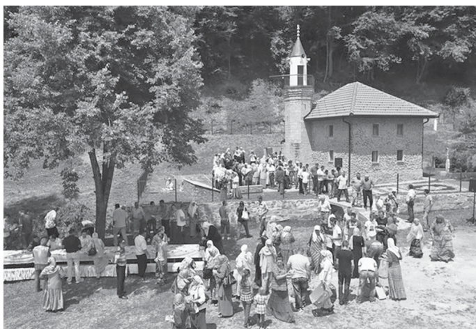
Slapovići – Opening of the rebuilt Slapovići mosque, 2011

During the siege of Srebrenica, hundreds of Bosniak refugee families sought shelter in Slapovići. When