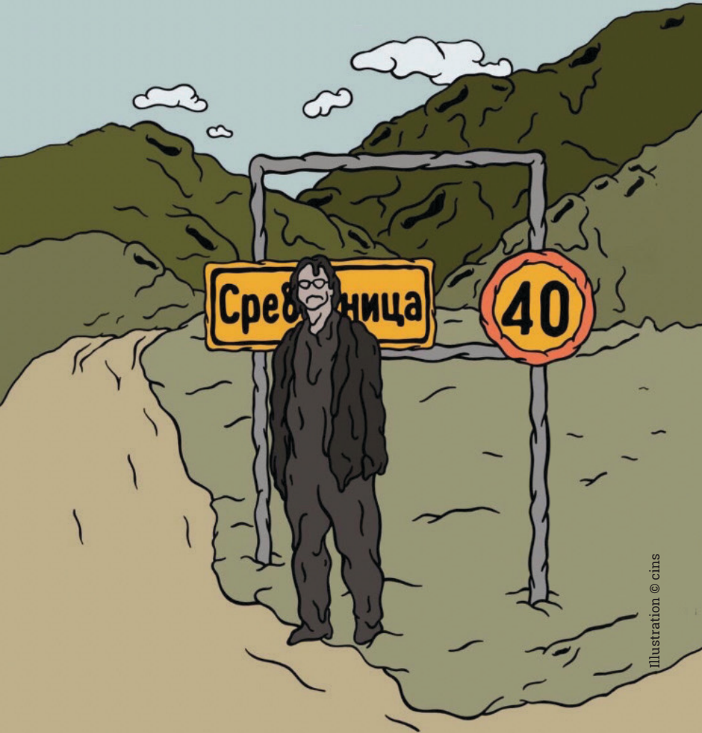
Illustration © cins