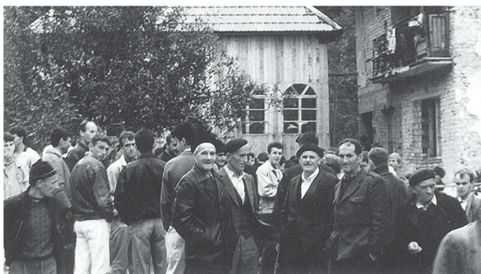
Srebrenica – Dozića džamija following repairs, 1993

A photograph that I took in July 1992, seven years after the war, shows the imam's house, which had been burned out in 1995, with a new roof and undergoing repairs. Next to the house, the empty site where the historic Đozić mosque once stood is overgrown with weeds.