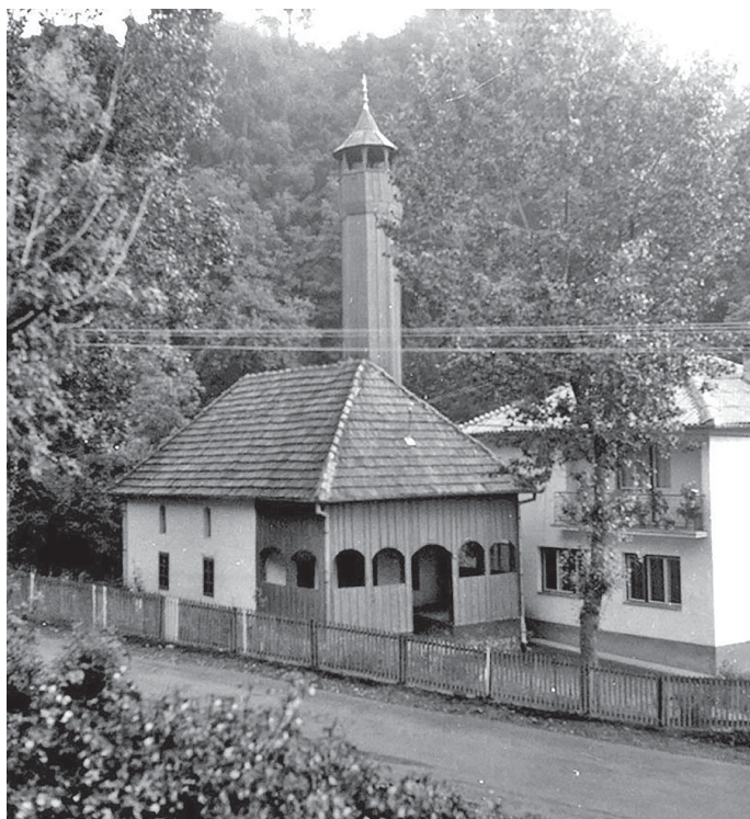
Srebrenica – Dozića džamija, 1980

In 1993, during the siege of Srebrenica by the Bosnian Serb Army, an aircraft crossed the Drina from the Serbian side of the river and dropped a bomb, damaging the Dozić mosque and killing a member of the congregation. Under siege conditions, the men of the Crvena Rijeka neighborhood worked to repair the damage. A photograph shows the men in front of the repaired mosque, following Friday prayers. Most of the men in the 1993 photo did not survive the July 1995 Genocide.