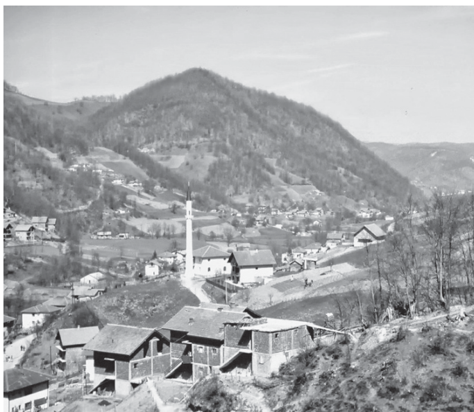
Srebrenica – The Vidikovac mosque during the war, 1994

In the Zoran Petrović Piroćanac video, the Vidikovac mosque and its minaret can still be seen standing as of 14 July 1995. But not for long. Like the other mosques in Srebrenica, the mosque Azem Begić built on Vidikovac hill was blown up with high explosives and left a gutted ruin.