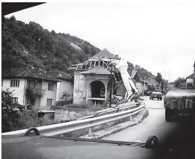
Srebrenica – Petrička džamija, 1996

In this photo, taken shortly after the end of the war, on 3 January 1996 by an Associated Press news photographer, one can see the destroyed concrete minaret of the Petrička mosque, its steel reinforcing rods spread apart by the force of the explosives used to destroy it, fallen on top of the mosque.