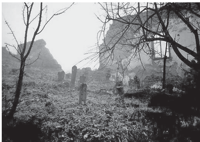
Srebrenica – Ruins of Hadži Skender-begova džamija, 1999

In March 2002, the site was cleared for reconstruction, and the White Mosque became the first mosque in Srebrenica to be rebuilt after the end of the war. 9