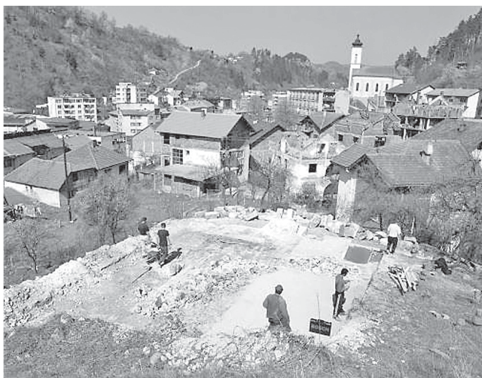
Srebrenica – Site of Hadži Skender-begova džamija, 03/2002

When I visited Srebrenica on my survey for the Hague tribunal the summer of 2002, I saw the newly rebuilt White Mosque and the town's Serb Orthodox church facing each other on the heights overlooking the market square – the first visible indication that postwar Srebrenica could once again be a town that accommodates the cultural and religious needs of both of its major ethnic communities. 10