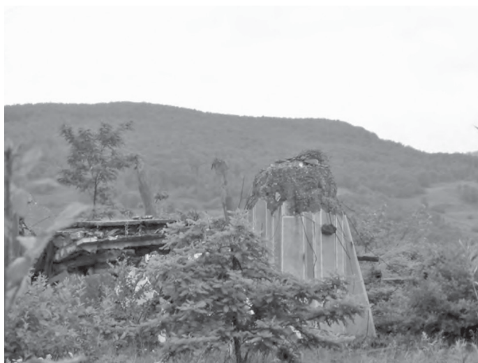
Osat – Remains of the destroyed Osat mosque, 2005

of their work was the Old Mosque (Stara džamija) in Peći. 13 Built in the eighteenth century the Old Mosque remained intact until 1992, when Peći, too, was overrun and ‘ethnically cleansed’.