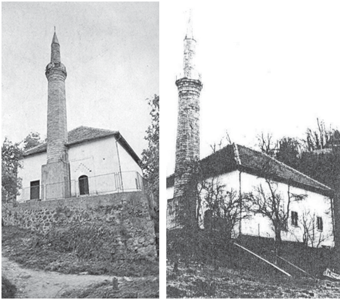
Srebrenica – Hadži Skender-begova džamija / White Mosque, 1981, (Photo: Ekrem Hakkı Ayverdi)

The oldest mosque in Srebrenica was the White Mosque, the Mosque of Hadži Skender-beg, built in the seventeenth century atop a rise overlooking the town center. The White Mosque, with its distinctive stone minaret, was surrounded by the Ottoman-era gravestones of an old Bosnian Muslim cemetery. 8 It also survived the 1992-1995 siege undamaged.