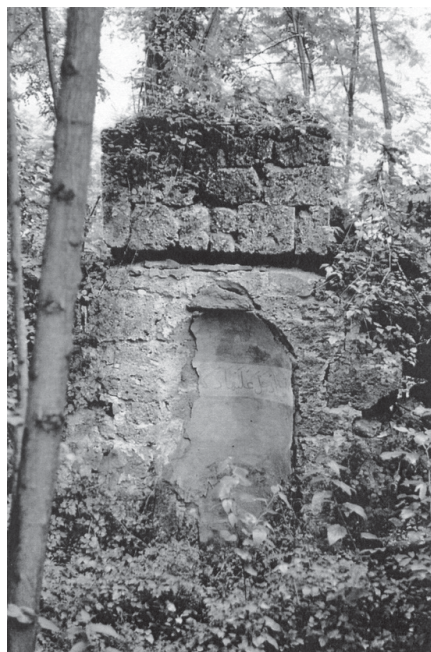
Peći – Mihrab of the Stara džamija, 2001