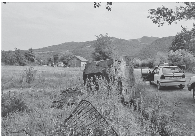
Dobrak – Site of the destroyed Dobrak mosque, 2002

That same month in 1992, the mosque in the Bosniak village of Dobrak, 4 km to the west of Skelani, was blown up, its ruins razed and removed, all except