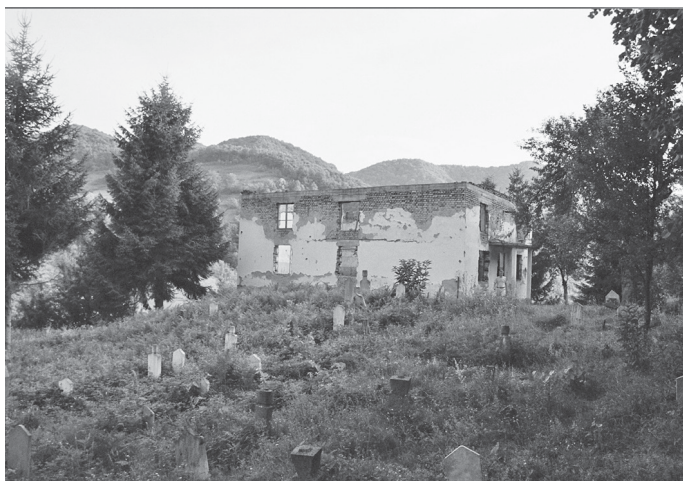
Srebrenica – Gornji Potočari mosque, 2002

There was a traditional stone mosque in the village of Slapovići, in a wooded valley 5 km west of Srebrenica. The village had a long history as a Bosniak settlement, with centuries-old Ottoman gravestones in its cemetery. In 1923, a prosperous local resident, Mula Selim Alemić endowed land and built a bridge, a water mill and a mejtes (Qur'an school) for Slapovići. In 1936 he also endowed a new mosque, built to replace an older mosque that had fallen into disrepair. People from eight surrounding settlements came to the new mosque for Friday and holiday prayers. 12