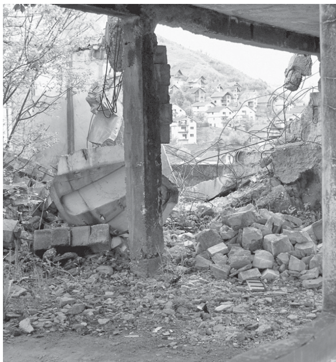
Srebrenica – Ruins of the destroyed Vidikovac mosque, 1999